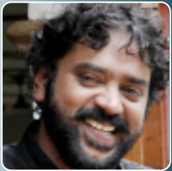
PADMASREE SANTHOSH SIVAN Cinematographer, Director, Producer, Actor