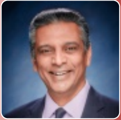
RAJ SUBRAMANIAM (BTech, MS, MBA) President & COO, FedEx Worldwide, Leads over 450,000 staff